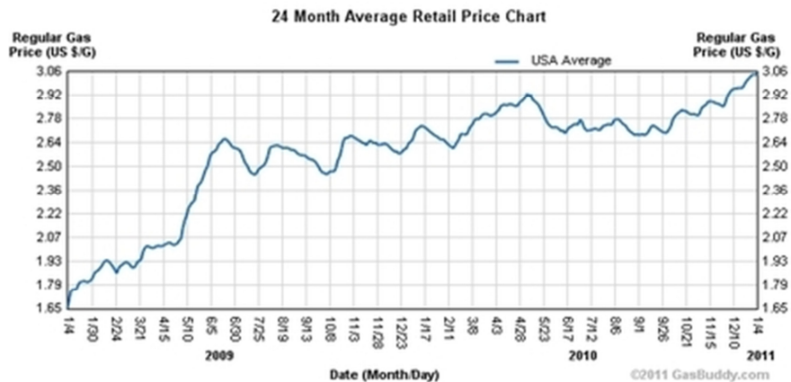
US petrol prices (2009-2011) - Source: GasBuddy, 01/2011